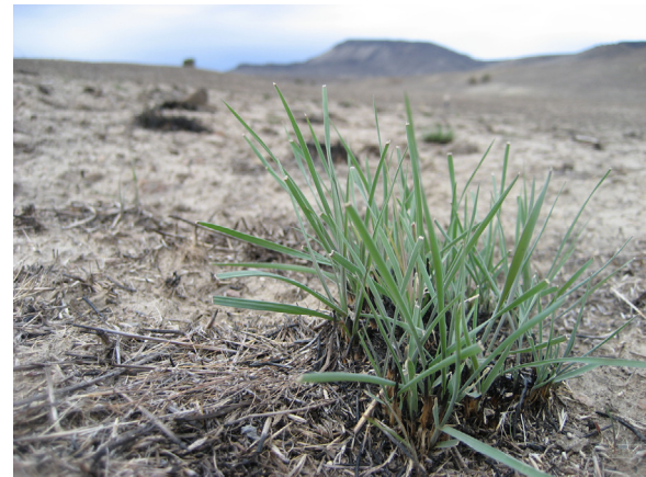
Figure 5. Post fire photo of surviving large perennial bunchgrass (bottlebrush squirreltail - Elymus elmoides Raf.).

tional groups also contribute vital ecosystem functions and related values. For example, sagebrush is critical to providing many habitat requirements of sagebrush obligate wildlife species, and forbs are essential for monarch butterflies, other pollinators, greater sage grouse ( Centrocercus urophasianus ), and other wildlife species. 24 As such, maintaining or restor-