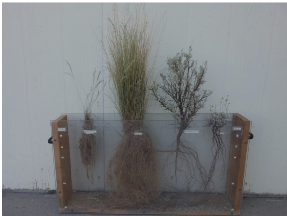
Figure 4. Plant display showing the rooting morphology of the primary plant functional groups comprising northern Great Basin sagebrush plant communities including, from left to right, small perennial bunchgrass (i.e., Sandberg bluegrass - Poa secunda J. Presl), large perennial bunchgrass (e.g., bluebunch wheatgrass - Pseudoroegneria spicata (Pursh) Á. Löve, shrub (e.g., Wyoming big sagebrush - Artemisia tridentata Nutt. Ssp. wyomingensis Beetle & Young), and perennial forb (e.g., whitewoolly buckwheat - Erigeron ochrocephalum S. Watson). Perennial bunchgrasses have the highest root mass among the plant types and effectively take nutrients and water from the soil, reducing available resources for invasives.

tional groups also contribute vital ecosystem functions and related values. For example, sagebrush is critical to providing many habitat requirements of sagebrush obligate wildlife species, and forbs are essential for monarch butterflies, other pollinators, greater sage grouse ( Centrocercus urophasianus ), and other wildlife species. 24 As such, maintaining or restor-