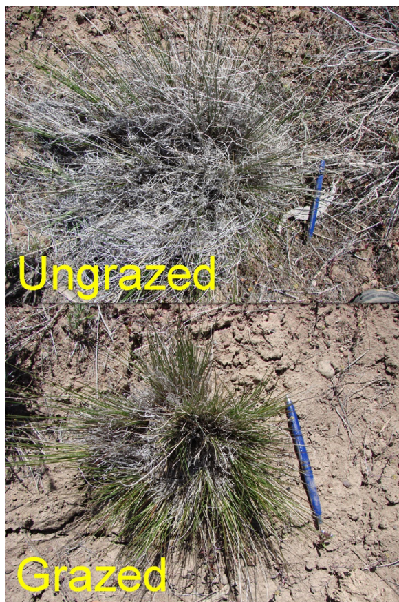
Figure 6. Litter accumulation associated with grazed and ungrazed large perennial bunchgrasses (Thurber's needlegrass - Achnatherum thurberianum (Piper) Barkworth) in northern Great Basin sagebrush-dominated rangelands.

ment. 39 High perennial bunchgrass mortality was likely a common outcome after periodic rangeland wildfire. 40 What has changed is the introduction of invasive annual grasses, which necessitates perennial bunchgrass recovery within a compressed timeframe compared to ecosystem recovery periods in the past. Indeed, conversion to a persistent annual grass state is practically assured in the absence of perennial bunchgrass recovery, especially in areas with lower abiotic resilience. Prior to the introduction of invasive annual grasses, recovery of sagebrush-dominated rangelands may have been slow depending on conditions, but the trajectory was largely secure. Invasive annual grasses have fundamentally changed the rules, requiring rangeland managers to consider alternative forms of management to promote bunchgrass survival and establishment after fire (see Boyd this issue). 22